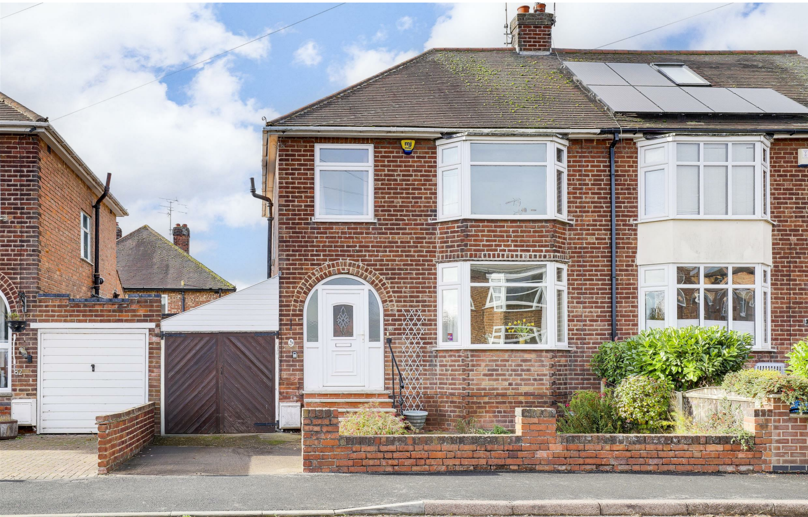
Netherfield Road, Long Eaton, Nottinghamshire NG10 3FX